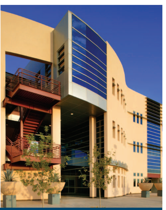
Webb Medical Plaza B-Sun City West, Arizona

ArchiCAD Virtual Building Solution Wins New Business for The Orcutt/Winslow Partnership